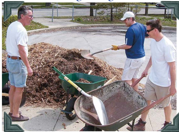
Gardening in Edgemoor